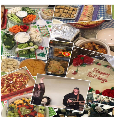
Glimpses of food and frolic at 2018 windup potluck.