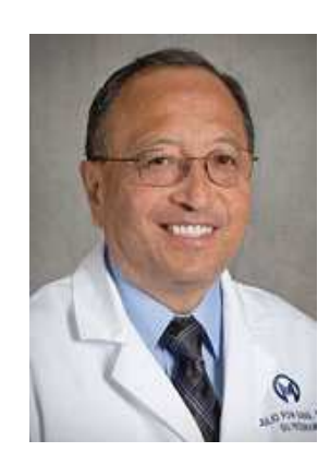
Julio Pow-Sang, MD

Traditionally, cancers that were localized—specifically in prostate cancer—were divided into organ-confined cancer, localized cancer, and locally extensive cancer. That was the extent of the stratification, and it was very difficult to determine what treatment to give.